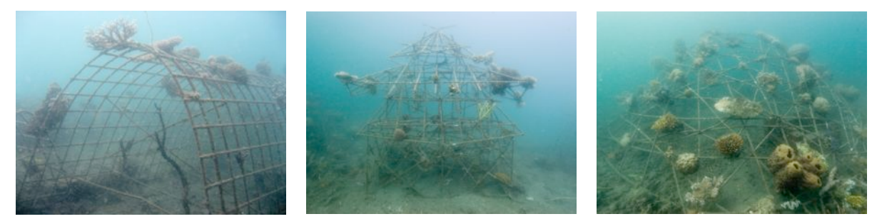
Figure 1: Photographs of the three Biorock installations: tunnel, pagoda, and dome respectively.

Currently the Biorock installations are "unofficial", meaning that Biorock Inc. (www.biorock.net) and/or the Global Coral Reef Alliance (GCRA, www.globalcoral.org) have not officially sanctioned the installations. As a result there are some outstanding questions about how best to maintain them, although the current guidelines seem sufficient for many aspects of ongoing maintenance. The long-term aim for these installations is to have them assessed to make them official, which should help to provide support by way of further information that can maximise their productivity.