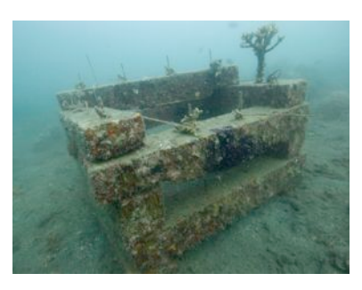
Figure 3: Photo of one of the larger and more stable concrete block installations, showing coral fragment transplants, and various other types of marine growth.

The concrete block installations (aka "fish houses") are scattered over a large area, from within the Biorock dome, heading North to near the mandarinfish dive site, generally between approximately 7-15m in depth. Some of the installations, particularly the smaller ones, appear unstable and close to toppling. The majority of the installations had a significant layer of coarse sediment cover. Nonetheless there was evidence of some coral settlement, with juvenile colonies starting to become established on some of the blocks. Two of the installations had large quantities of macroalgal growth on them, to the extent that coral larvae settlement would be very unlikely. They are located next to a natural reef area that also has high macroalgal cover, and while there are herbivorous damselfish resident in the area,