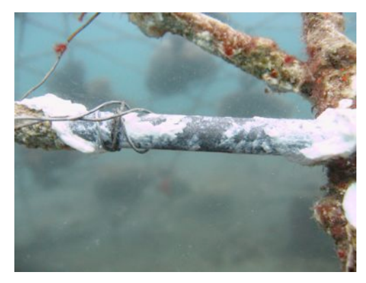
Figure 1: Close-up photo of Biorock, showing where a dead coral fragment has been removed. Such a site is a good choice for a new transplant to be made, as calcium carbonate deposition (and therefore coral attachment) will be fast on the metal. Notice that the wire used to attach the coral fragment is touching the bare metal.

All transplants should be attached to well-cleaned Biorock substrate, with healthy live tissue held securely against either the metallic surface or to algae-free calcified deposit. Attachment site should be thoroughly cleaned/checked before attachment, and must be made securely enough that the coral fragment will not move around in the water current, as insecure attachment is known to increase fragment mortality (Bowden-Kerby, 2001). When a coral transplant has died and needs to be removed, the removal of the old transplant can sometimes pull away calcified deposits down to the metal base. As this metal base is likely to provide the fastest site of new CaCO<sub>3</sub> deposits, it is recommended to use this as a site for a new transplant while the metal is still bare (Figure 1).