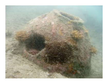
Figure 4: Photo of one of the reefball installations, showing good growth of Acropora corals.

There are 21 "reef-balls" located on the house reef, grouped into two main clusters of eight and ten, along with three singles elsewhere. Each reef-ball is a hollow hemisphere with a hole in the top, and various holes located on the sides, giving a large surface area onto which corals (and other marine life) may settle, while also stabilising the substrate and providing shelter for other marine life. The reef-balls are made from a modified cement recipe (unsure of exact details), probably with a coarse grade of sand to help provide a textural surface with greater area. Cement is an alkaline material, and as such could help to prohibit settlement and growth in normal circumstances, so the reef-balls have been treated to neutralise the surface alkalinity.