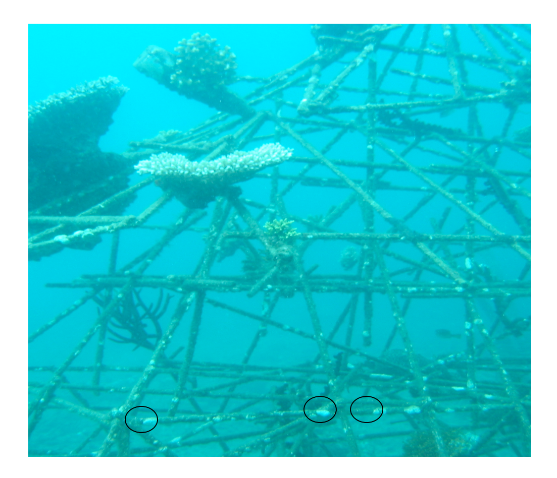
Figure 2 : Pagoda biorock with calcium deposition (white spots) on the metal construction.