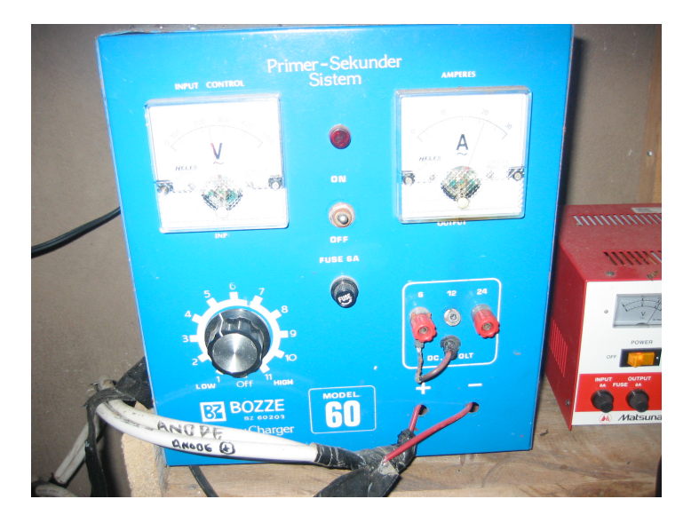
Figure 3: Electrical: supply 12V, 20 Amps total for all biorocks

Figure 2 : Pagoda biorock with calcium deposition (white spots) on the metal construction.