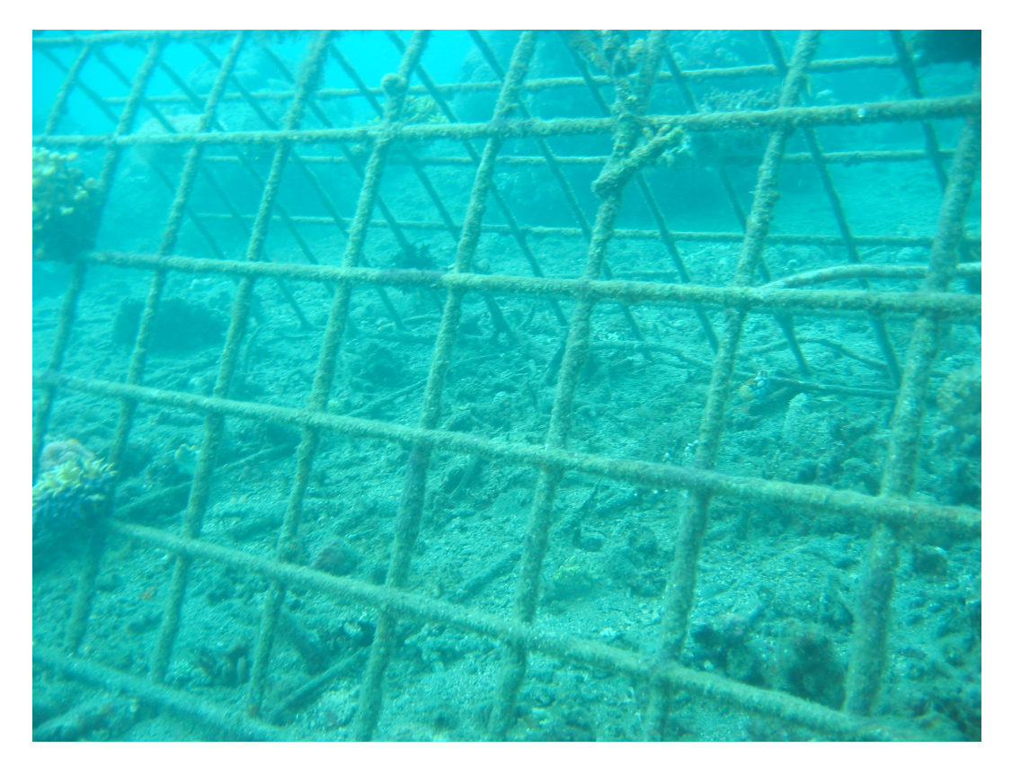
Figure 1 : Algae coveraged on biorock, 1-2mm, under there is a thin layer (less then 1mm) of calcium deposition.